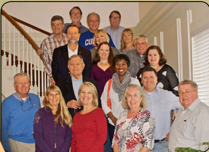
Executive Council Members, Executive Council Meeting February 2015, Crystal River